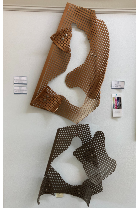
CopperSun and Bronze Tone Perforated Pentagons